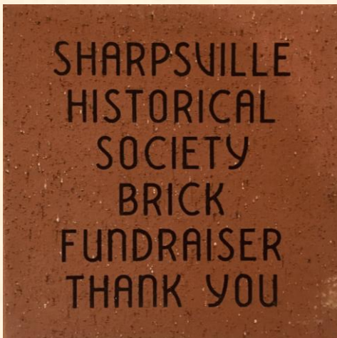
Samples of the 8"X8" brick and the 4" X 8" brick